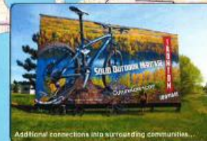
Additional connections into surrounding communities...