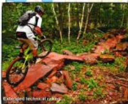
Extended technical riding...