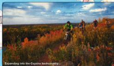
Expanding into the Cuyuna backcountry...