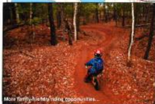
More family-friendly riding opportunities...